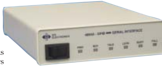
4894B GPIB-to-Serial Interface

The Model 4894B is an enhanced bidirectional IEEE-488.2/GPIB to serial interface that can be used to adapt devices with RS-232 and RS-485 (RS-422) serial interfaces to the GPIB Bus. A 256 Kbyte RAM buffers up to 252,000 characters and frees the computer for other tasks while the 4894B transparently transfers data to or from the serial device when in the G mode. The 4894B's high speed DMA handshake transfers data at rates > 600 Kbytes/sec to minimize GPIB bus data transfer time. The 4894B's ability to run at any rate from 50 to 115,200 baud and in full or half-duplex mode makes it the ideal interface for driving modems, plotters, PLCs, RS-485 networks and other serial devices from the GPIB Bus.